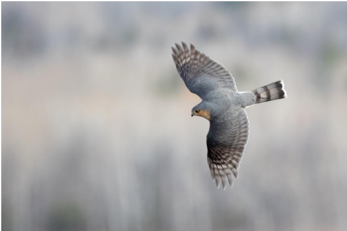
Sharp-shinned Hawk migrating below Hawk Ridge

Note that to be eligible for some benefits, travel insurance must be purchased within 1-2 weeks of paying the trip deposit.